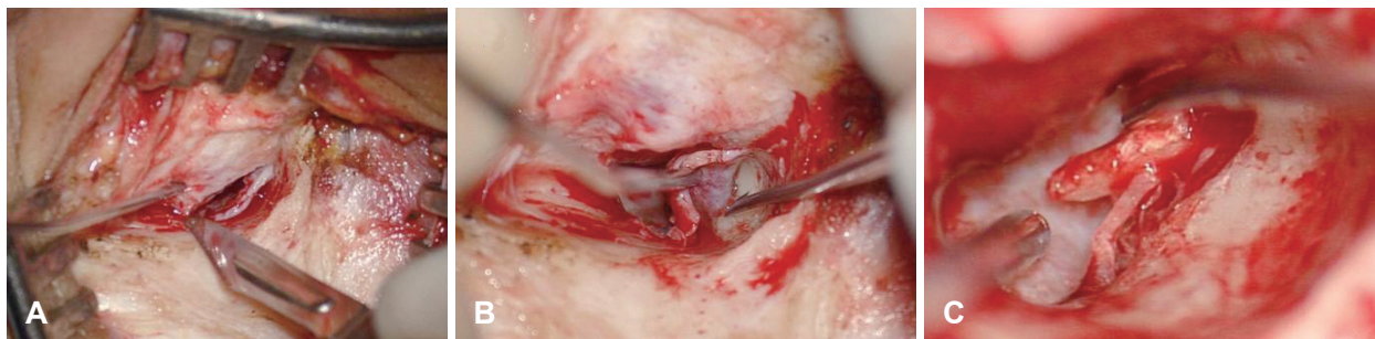
Fig. 1. Retro-auricular surgical approach. A: Incision of the posterior wall of the external auditory canal. B: Detachment of the tympano-malleal flap. C: Detachment of the malleus handle and preparation for placement of the graft.

The study population consisted of 150 patients with a mean age of 33 years (range 9 to 68 years). The pediatric population